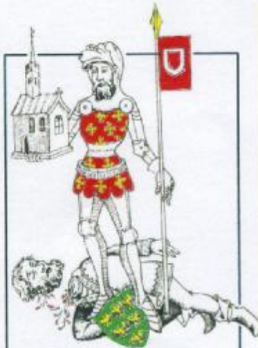
The murder of Gaveston.

Piers was made Constable of Nottingham Castle by Edward in 1310, but the barons were resentful of his power and they murdered him in 1312. Edward then turned his affection to a slimy gold-digger called Hugh Despencer. Edward himself was later deposed and murdered.