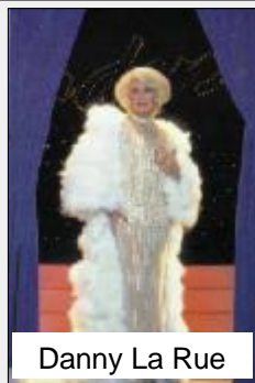
Danny La Rue